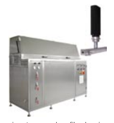
wire-, tape- and profile cleaning