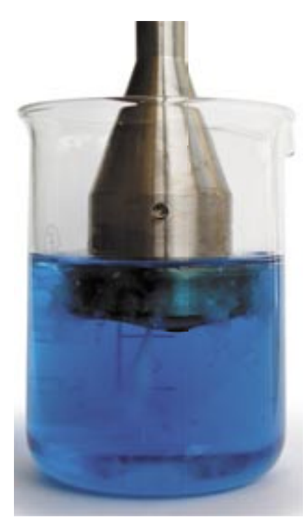
cavitation at S40

The ultrasonic processor UP200S (200 watts, 24kHz) differs from the UP200H only with its shape and its use only with stand.