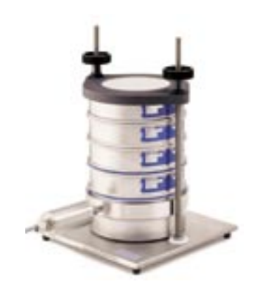
ultrasonic sieving in the laboratory