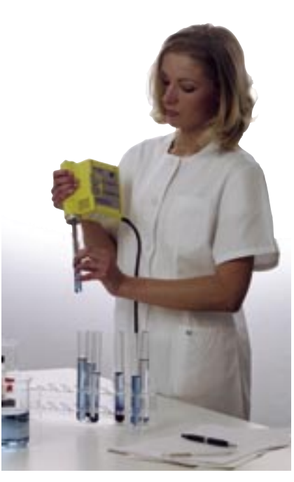
UP100H with MS7

For continuous operation only a flow cell and the appropriate 7mm sonotrode is required. Continuous processes in the smallest scale can be simulated. The optional PC-control may be helpful, if a test record is necessary or to optimize processes.