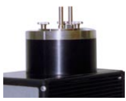
UTR200 as reactor chamber

The sonoreactor UTR200 (200 watts, 24kHz) works as an ultrasonic bath but at a 50 times higher intensity. In addition, it is dry-running protected. It is suited for the direct or indirect sonication of liquids e.g. for cell disruption, homogenizing or emulsifying. The beaker-shaped sonotrode is machined from one piece in order to prevent leakages. The upper part of the sonotrode is oscillation-free and can be used for mounting the respective accessories for diverse application cases. A corresponding reactor cover takes the Eppendorf tubes or test tubes for indirect sonication. By means of the reactor cover the chamber is hermetically sealed. If the cover has an additional inlet and outlet the sonoreactor can be used as a flow system. A sieving extension with a bajonet lock takes a pile of sieves for fine grain sizes (diameter 75mm, finest mesh size 5 micron). The ultrasound, which is transmitted to the sieves, accelerates the wet sieving process.