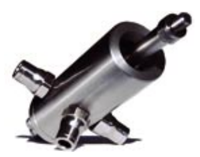
stainless steel flow cell D7K with MS7D