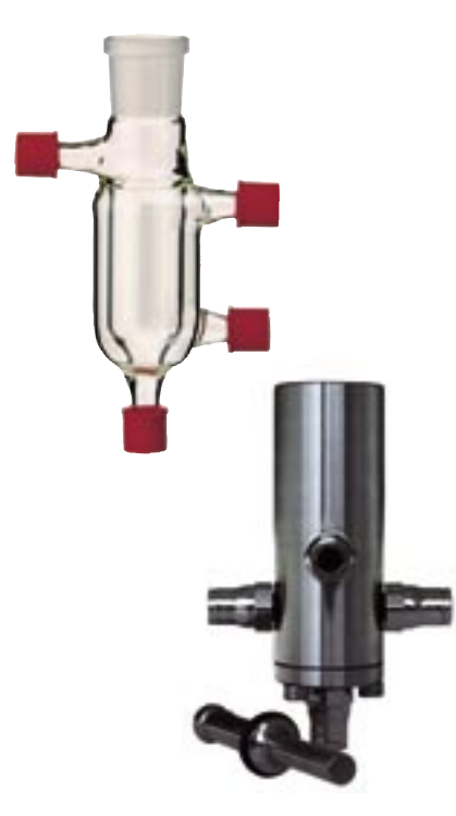
flow cells GD7K and D7K

The ultrasonic processor UP100H (100 watts, 30kHz) has the same dimensions as the UP50H but it is suited for the double power output. With the use of the 10mm sonotrode the field of applications expands to applications with volumes of up to 500ml.