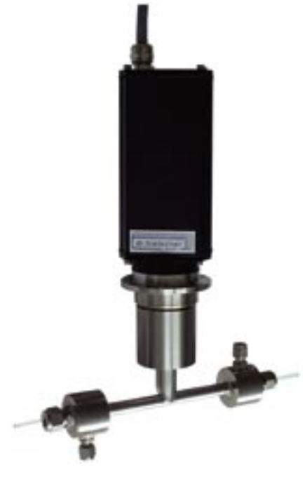
UIP250H56 with mini flow cell Dmini

For our ultrasonic processor we offer flow cells made of glass or stainless steel. The liquid to be sonicated is lead in from below and passes through the cavitation zone under the sonotrode. appropriate sonotrodes The equipped with O-rings, that are fitted closely to the cell wall or the PTFEadapter. For higher pressures and temperatures the sonotrodes may be equipped with metallic oscillating-free flanges that are mounted to the stainless steel flow cells. The selected flow rate corresponds to the energy input required. The temperature of the medium can be influenced by means of a cooling jacket. Special designs of the flow cell e.g. several supply connectors, when emulsifying are manufactured according to the demands of the customer. A new product in our product range is the mini flow cell (patent pending). When using this mini cell, the medium is hermetically sealed, so that the sonication can be realized without contamination.