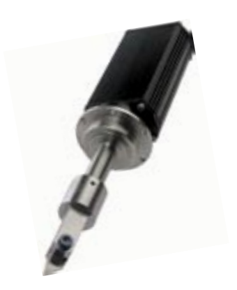
cutting and welding