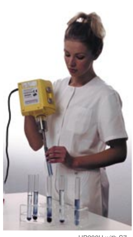
UP200H with S7

We offer a comprehensive range of accessories for the UP200H such as flow cells, stand, sound protection box, timer and PC- control.