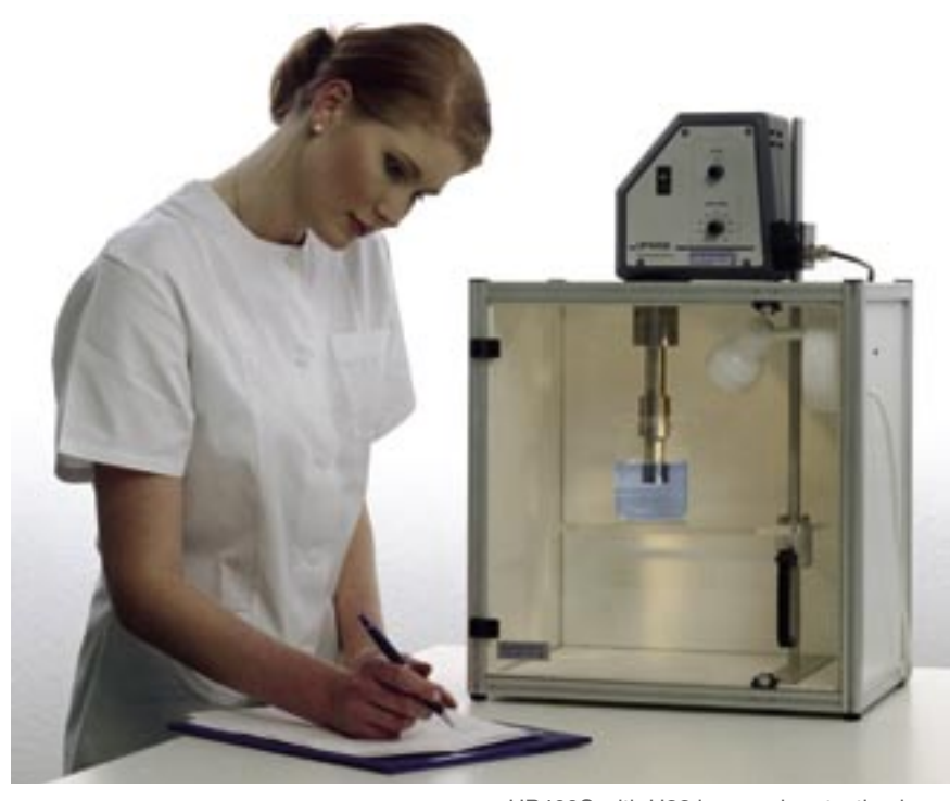
UP400S with H22 in sound protection box

The ultrasonic processor UP400S (400 watts, 24kHz) is our most powerful laboratory device. With sonotrodes of a diameter range from 3 to 40mm the device is suited for sample volumes from 5 to 2000ml. In flow approx. 10 to 50 liters per hour can be treated. For the preparation of test portions the UP400S is mainly used for bigger volumes. It is suited for the practical process development in the laboratory but also in the college of technology as well as for the production of small quantities. For production quantities a PC-control or a connecting lead to a central control of the user's plant is recommended in order to raise the process safety. With special flow cells and flange connections liquids can also be sonicated at high temperatures and pressures.