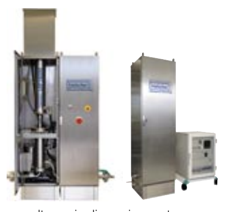
ultrasonic dispersing systems