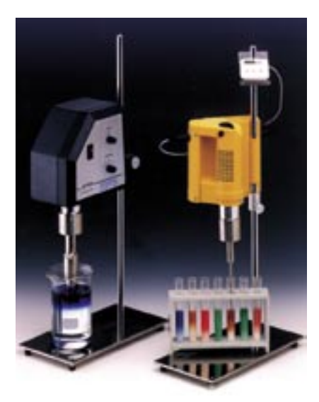
UP400S and UP200H with timer

Since working surface in the laboratory is expensive we supply ultrasonic processors with a compact design: Power supply, generator, control and transducer, all of which are located in an aesthetic housing. No additional cables impede.