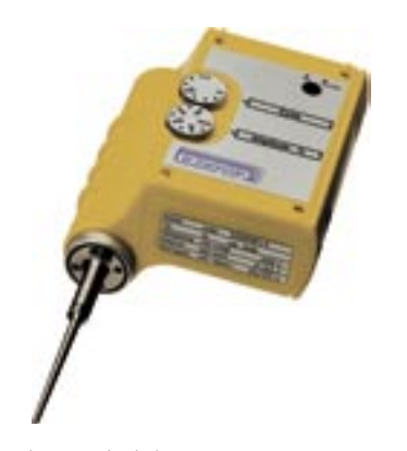
ultrasonic laboratory processors