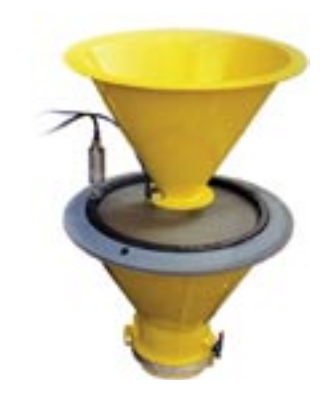
industrial ultrasonic sieving