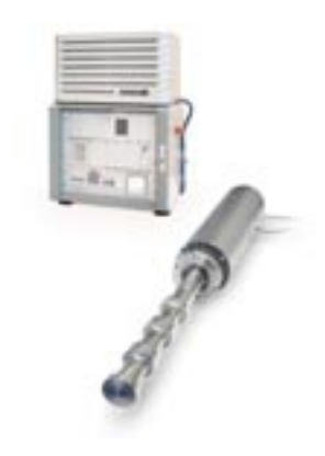
ultrasonic industry processors