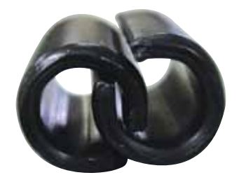
Example of interlocked Slotted Pins.

The square ends and the absence of slots have a substantial impact on trouble-free automatic feeding. Of most importance is the absence of a slot which eliminates pin nesting and interlocking—a major problem in automation.